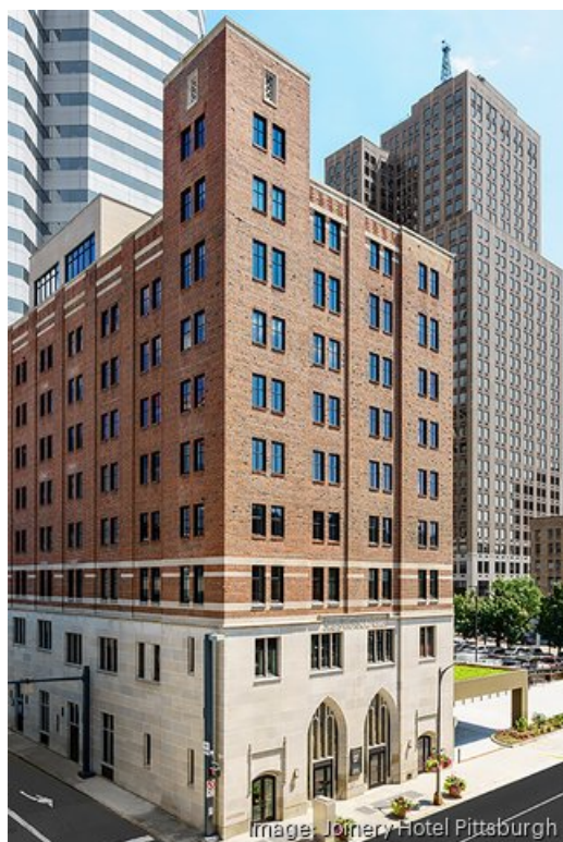
Joinery Hotel Pittsburgh

The exterior of the Joinery Hotel Pittsburgh.